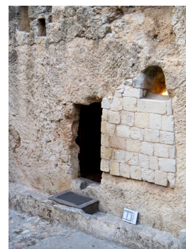
Empty tomb in Jerusalem